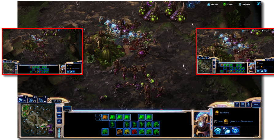
Fig. 1: A Protoss army (gold; green on mini-map) attacking a Zerg army (brown; purple). Left: uniform scaling, right: non-uniform scaling

games. A variant, adaptive interfaces, achieves similar aims by pre-formatting a web site for 6 different screen size configurations.